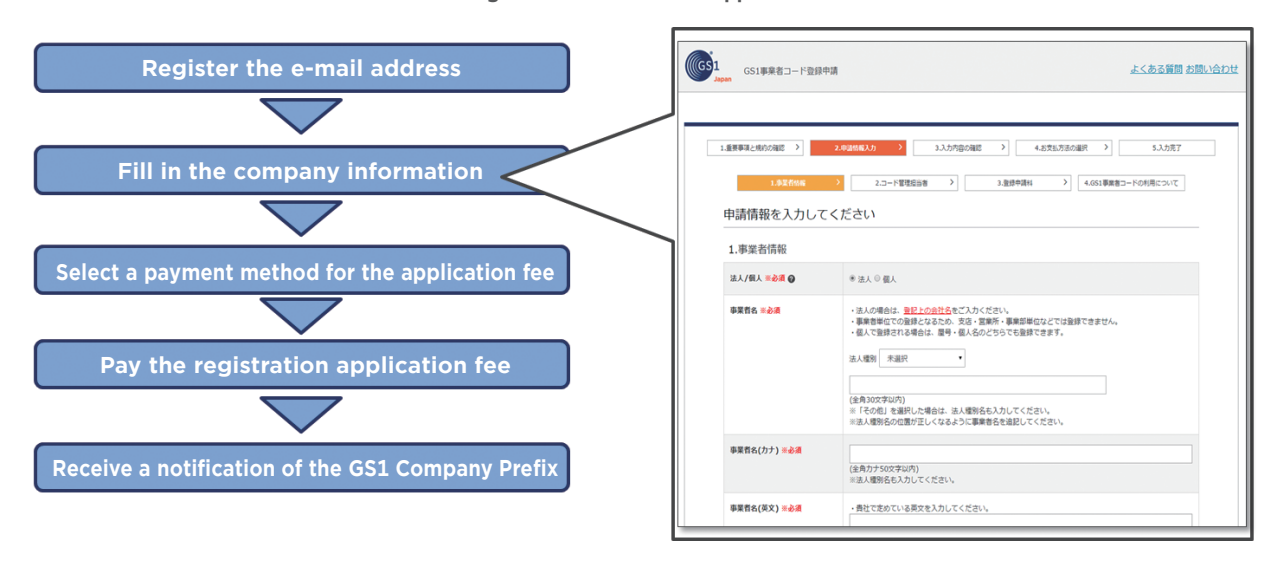
Fig. 2 Flow of the online application

3. Fill in and submit the registration application form. There were several problems with the previous application process for the GS1 Company Prefixes. First, the procedure was complex for the applicant. The registration application form was attached to the GS1 Company Prefix manual, and to obtain the form, the applicant needed to purchase the manual. The applicant also needed to pay for the manual, on top of paying for the registration application fee, which doubled the financial burden.