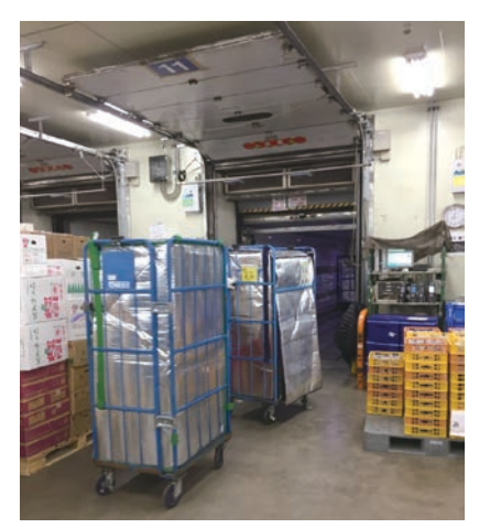
Fig. 3 Cage trolleys passing through the gate