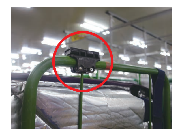
Fig. 1 RFID tag attached to the top of a cage trolley

own cage trolleys even in situations where they get mixed up with other companies' trolleys on the premises of the destination retail store.