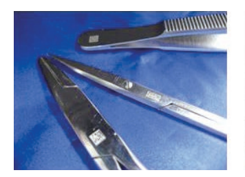
Fig. 1 GS1 DataMatrix directly marked on steel instruments

The necessity of direct marking for medical devices including steel instruments are described in the UDI (Unique Device Identification) guidance of IMDRF (International Medical Device Regulation Forum) and the U.S. FDA (Food and Drug Administration) UDI rule.