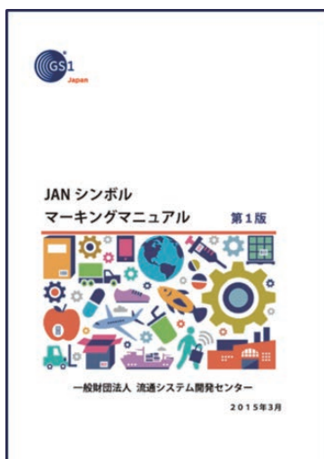
Fig. 1 JAN Symbol Marking Manual

GS1 Japan prepared and published the “JAN Symbol Marking Manual” in March 2015. (*1)