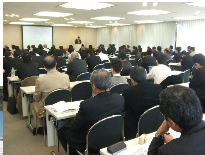
Briefing Session (Dec. 1, 2009)