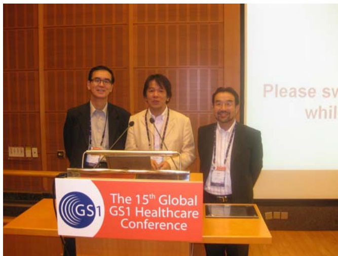
GS1Healthcare Hong Kong Conference (Oct. 7, 2009)